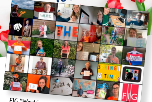
FIG "Working from home Week" 2020.