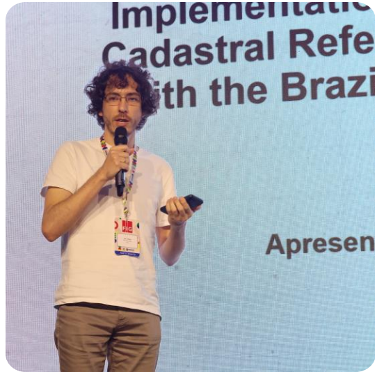
FIG C7 AM 2025 - Wrap Up

Our first-ever Commission 7 Annual Meeting in Brazil was held from 3–5 November 2025 in the vibrant city of Florianópolis. Hosted by the Federal University of Santa Catarina (UFSC), the event brought together 265 participants from 21 countries, creating a truly global platform for knowledge exchange.