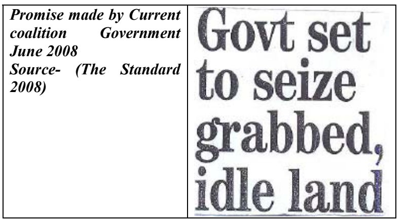
Table1-Excerpts ofSuccessivePostColonialGovernmentsshortlyaftertheyassume office