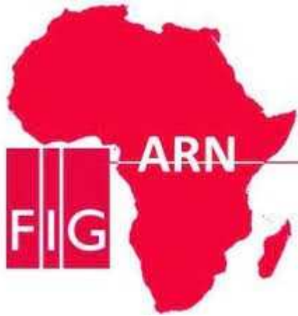
FIG-ARN and the AUC Agenda 2063 cont'd