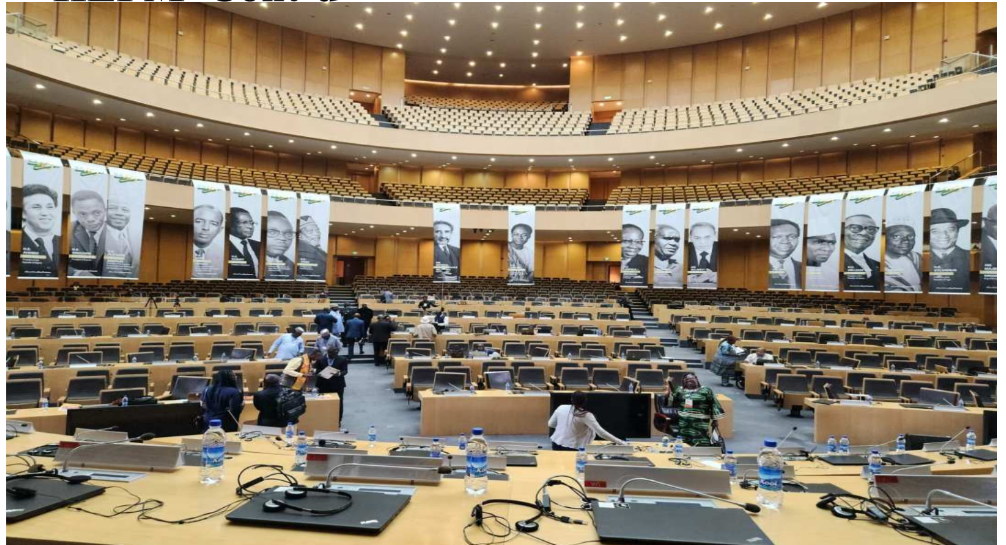
FIG-ARN FHLFM Presidents of African land professional associations –Mandela Hall AUC Hqs.